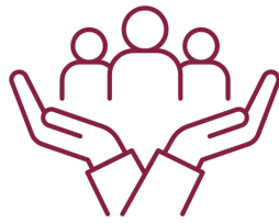
leadership support for diversity